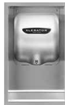
Part # 40502