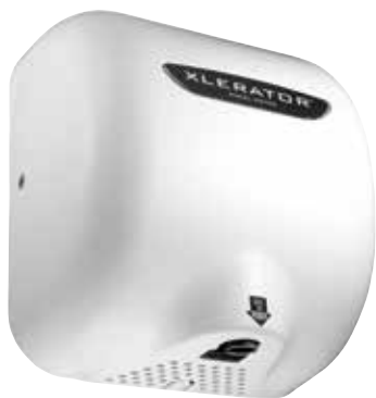
XL-BW White Thermoset Resin (BMC)

MODELS: XL - BW W GR C SB SI SP OPTIONS: -1.1N (Noise Reduction Nozzle) -H (HEPA Filter) -VOLTAGE (See Chart)