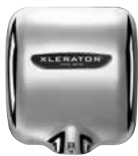
XL-C Chrome Plated