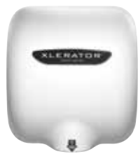
XL-W White Epoxy Painted