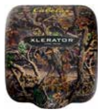
XL-SI*** Custom Special Image