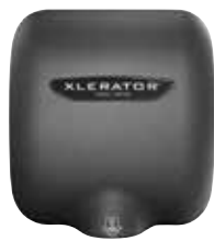
XL-GR Graphite Textured Painted