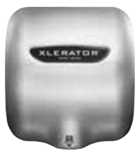
XL-SB Brushed Stainless Steel

* Dry time based on third party testing performed by SGS International on standard XLERATOR hand dryer with 0.8 nozzle to 0.2g or less of residual moisture.