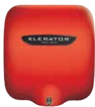
XL-SP** Custom Special Paint