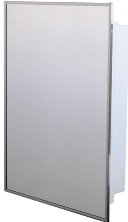
Code 800W Front view / Top View